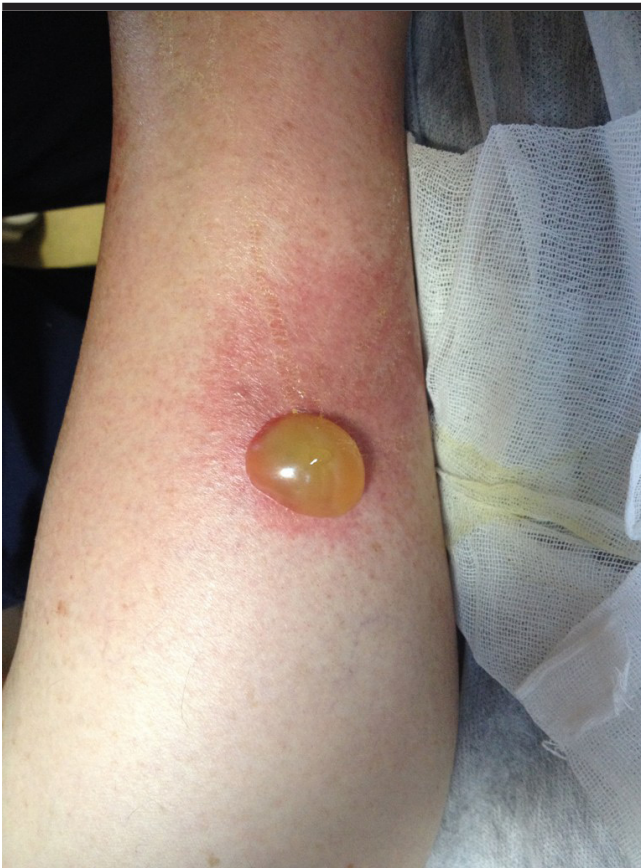
Figure 1. Bullous lesion (3 cm × 2 cm) was present on the erythematous lateral surface of the right leg

The etiopathogenesis of the responsible drug has not been fully elucidated although it is believed to be associated with basal keratinocytes acting as a hapten and causing antibody-dependent cellular cytotoxicity. Moreover, high HLA-B22 expression is known to produce genetic liability (11).