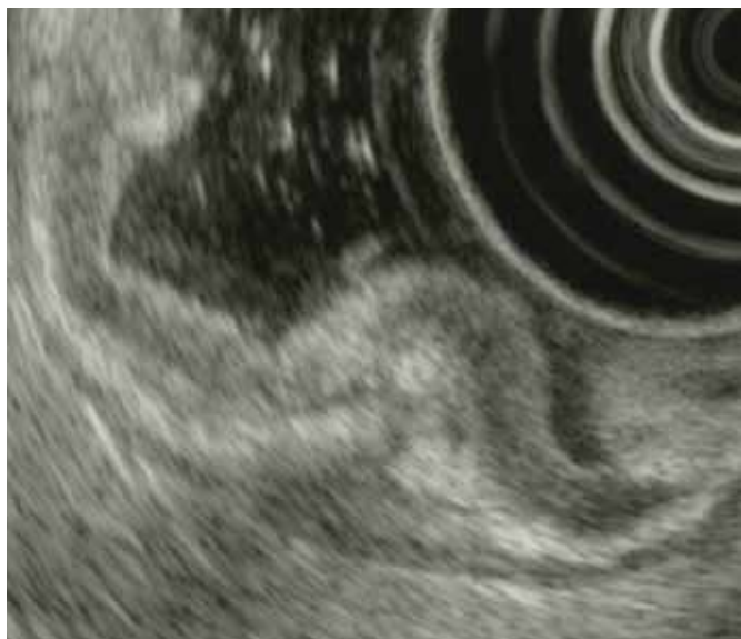
Figure 2. Endoscopic ultrasonography revealed marked thickening of the second and third layer, with a heterogeneous echoic pattern at the gastric folds of the body.

active and felt well, and an upper endoscopic examination revealed a much improved state of the lesion (Figure 4).