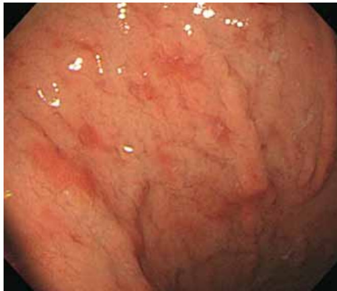
Figure 4. After 3 years of follow-up, an upper endoscopic examination revealed an improved state of the mucosal lesion.