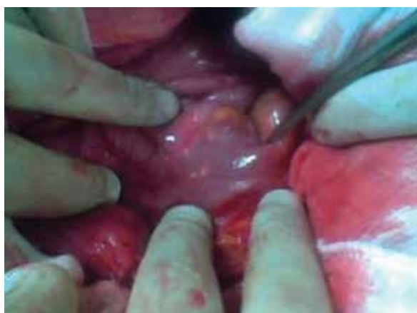
Figure 1. Intraoperative photograph of the surgical fields: diffuse macroscopic inflammatory reaction of mesentery and bowel, with multiples granulatous, whitish lesions disseminated on the small bowel wall and the parietal peritoneum.

The abdominal computed tomography (CT, Somatom Emotion, Erlangen, Germany) performed after surgery showed an agglutination of intestinal loops in the left hemiabdomen, associated with subtle increased attenuation in the mesentery fat and a low amount of subparietal ascites (Figure 3). These imaging features suggested a diagnosis of sclerosing mesenteritis (3).