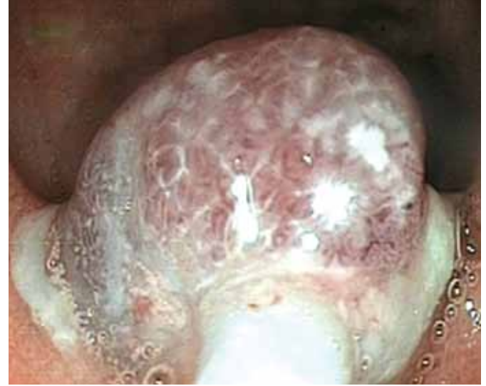
Figure 3. Endoscopic view of the lesion resected by polypectomy snare.

Informed Consent: Written informed consent was obtained from patient who participated in this case.