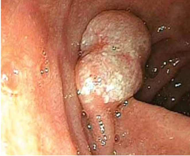
Figure 1. Endoscopic view of lymphangioma of the duodenum bulb.