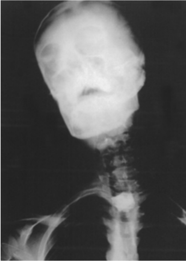
Figure 1. Postero-anterior cervical radiograph