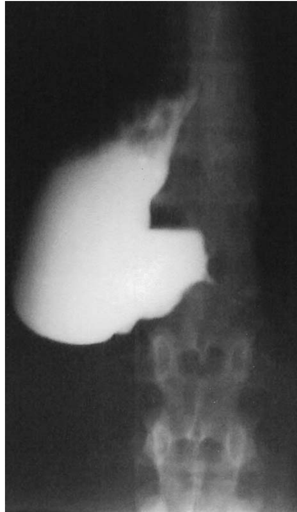
Figure 2. S-shaped dilated esophagus in barium X-ray

with retained food and it was impossible to reach the esophagogastric junction because of the tight stricture. Barium X-ray revealed S-shaped dilated esophagus (Figure 2) and computerized thorax tomography showed diffuse concentric thickness at gastroesophageal junction and severe esophageal dilatation. Liquid material (1 L) including retained food was drained by 18F esophageal tube. Mediastinal enlargement related to megaesophagus disappeared on chest X-ray after decompression. Oral feeding was stopped and parenteral nutritional support was started. Esophageal manometry was performed. The catheter was replaced under endoscopic view. First, a guide-wire was inserted through the stenotic esophagogastric junction by endoscopy and then a manometry catheter was replaced. A direct radiogram was performed to control the localization of the catheter. His esophageal manometry was also compatible with achalasia [simultaneous contractions and absence of lower esophageal sphincter (LES) relaxation].