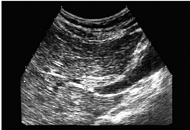
Figure 1. Ultrasonographic view in patient no. 5 shows the common bile duct as larger than normal (10 mm) and nearly full with formations with an echoic structure similar to the liver parenchyma.

patica (19). Similarly, we found that only one patient (14.3%) with IgG positivity had eggs of Fasciola hepatica in their stool.