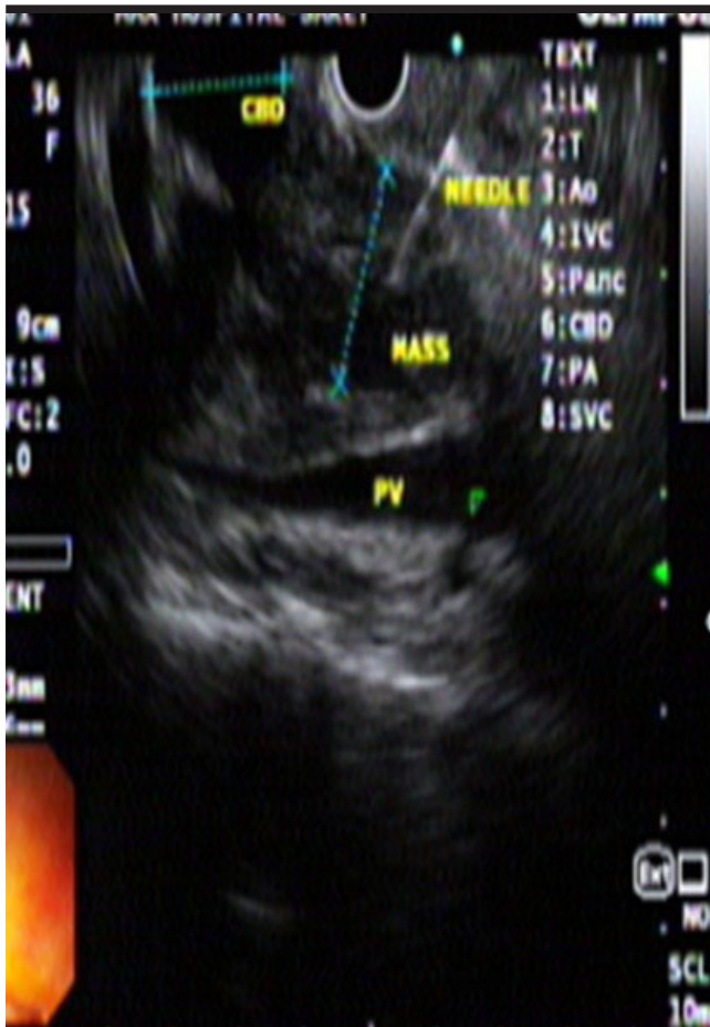
Figure 2. Shows fine needle aspiration of heteroechoic mass lesion of common bile duct on linear array endoscopic ultrasound

Abdominal TB is generally classified as gastrointestinal TB, peritoneal TB, TB of the mesentery, and TB of solid organ viscera and abdominal lymph nodes. It is prevalent in developing nations as a complication of pulmonary TB, as a part of disseminated infection, and often as an isolated presentation. Primary involvement of the liver in TB is rare because of the low tissue oxygen level, which makes the liver unfriendly for the propagation of the bacilli (1). Hepatic TB is observed in predominantly three forms, namely, (1) miliary hepatic TB, seen as a part of systemic tubercular infection where small tubercular lesions can be seen diffusely distributed across the liver and where patient remains almost asymptomatic from the hepatic perspective, (2) primary TB of the liver without the involvement of other organs present as granulomatous hepatitis, and (3) tubercular abscess and nodular TB.