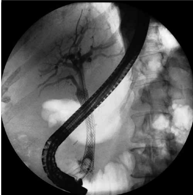
Figure 1. Cholangiogram showing stenosis