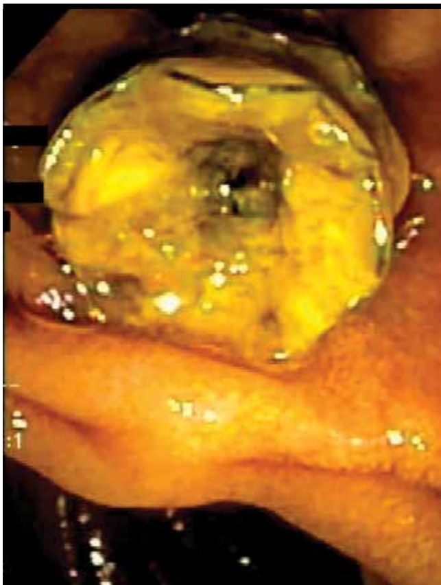
Figure 2. An endoscopic image of biliary obstruction