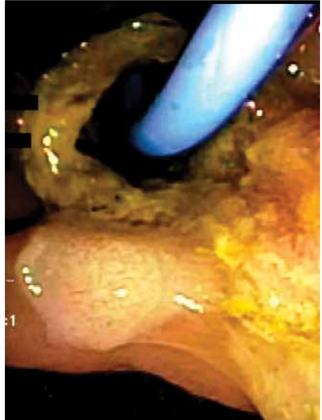
Figure 3. An endoscopic image noting mucosal changes after radiofrequency ablation

ampullary mucosal blanching provided the necessary substantiation for thermal injury-induced acute pancreatitis. Thermal injury from electrocautery is a known risk factor for acute pancreatitis; however, RFA-induced pancreatitis has not been well described and is another cause for acute pancreatitis (4). As per our knowledge and literature review, this is the first report of RFA-induced acute pancreatitis with endoscopic evidence of mucosal blanching. In a single center study assessing the safety of RFA in malignant biliary strictures, one patient developed mild pancreatitis, but without endoscopic findings of thermal burn injury (1). In another study, one patient had an elevated amylase level post-procedure, but was asymptomatic (3). However, these studies did not evidence the ampullary and periampullary mucosal changes observed in our patient. As RFA through SEMS is being used more widely, thermal burn injury-induced acute pancreatitis represents a potential adverse event, and gastroenterologists should be aware of this possible complication.