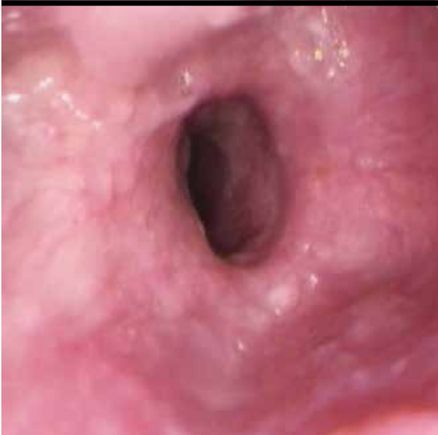
Figure 1. Endoscopic image showing patulous upper esophageal sphincter