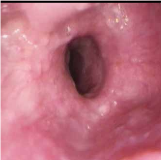
Figure 1. Endoscopic image showing patulous upper esophageal sphincter