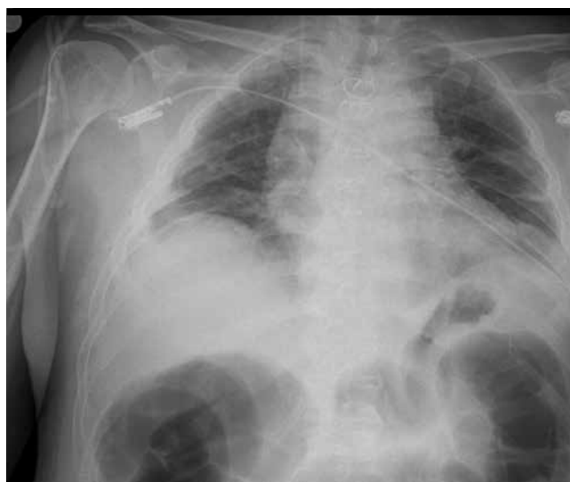
Figure 2. The telecardiogram imaging of the patient at postoperative day 9 showed bilateral opacities and minimal pleural effusion

port and plasmapheresis, and he was discharged after healing from surgery on postoperative day 23. Written informed consent was obtained from the patient for publishing this case.