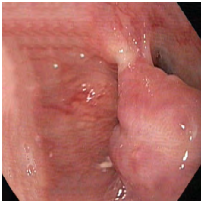
Figure 2. A large prolapsing lower esophageal varix with synechiae to the opposite esophageal wall