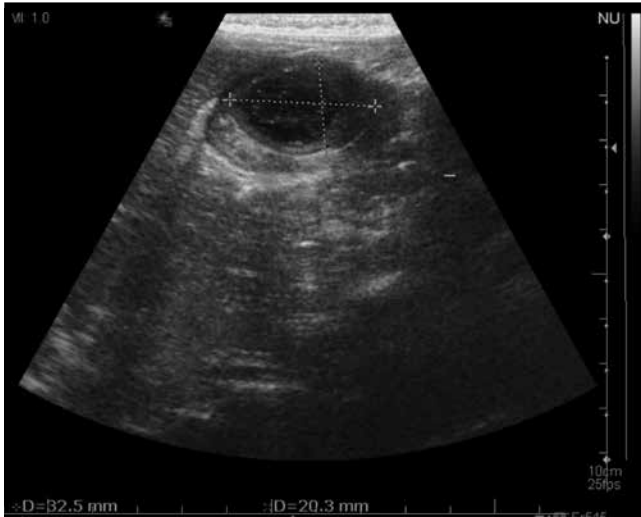
Figure 2. Abdominal ultrasonography showed a thickened wall cystic lesion measuring 32×26×20 mm on the anterior wall of the stomach in the pyloric region