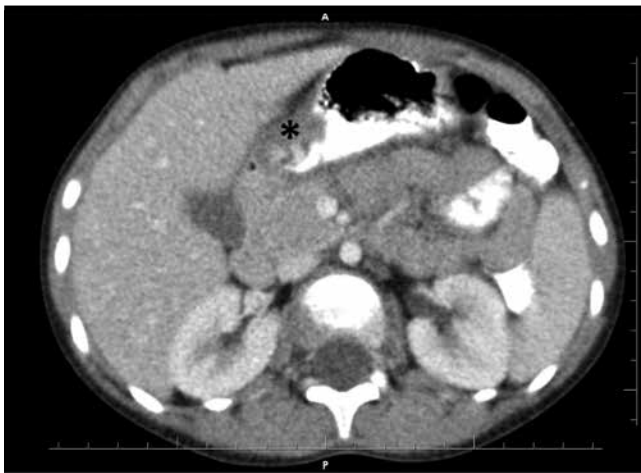
Figure 3. Preoperative computed tomography: Soft tissue thickening at the anterior wall of stomach and pylorus (asterisk); the widest segment was 19×12 mm

these patients, 4 patients [1-week-old boy (4), 13-day-old boy (5), 1-month-old girl (1), and 4-month-old girl (3)] were misdiagnosed as having hypertrophic pyloric stenosis. The presence of gastric duplication cyst was considered in differential diagnosis of a 5-year-old girl whose clinical and radiological findings were similar to our case (2). These pathologies are more frequent at etiology of vomiting in the pediatric age group (1-5). A misdiagnosis may lead to a delay in the excision of the mass and pathological diagnosis. USG or CT of all the reported cases showed cystic or heterogenous in-