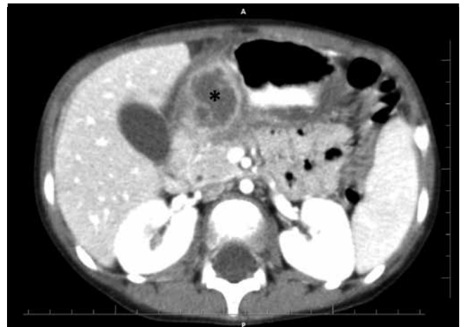
Figure 1. The initial computed tomography image: A cystic lesion (asterisk) measuring 30×28 mm at the gastric antrum

Previously, five pediatric cases of gastric adenomyoma have been reported in the literature. The major complaint of the patients was vomiting (1-5). Among