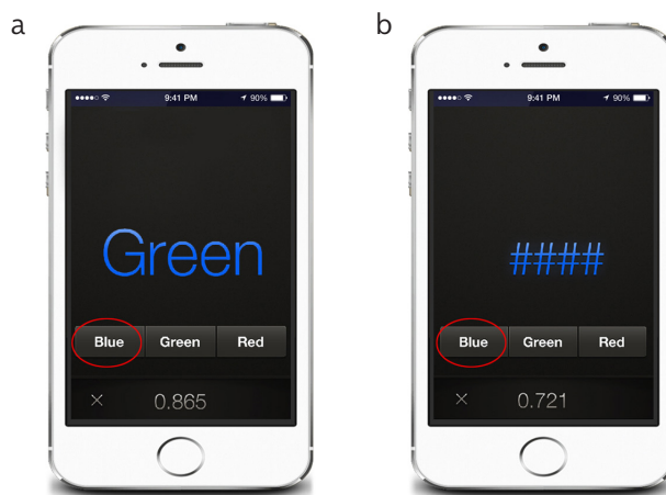
Figure 3. a, b. The ideograph of the EncephalApp Stroop App. (a) Subjects should correctly press the color corresponding to the that of the presented symbols. (b) Subjects should correctly press the color corresponding to the that of the presented word

With the popularity of smartphones, blood glucose and blood pressure can be monitored using relevant applications. In 2013, Bajaj et al. (23) developed an application, the EncephalApp Stroop App, for screening MHE that is operated by the iOS system on the iPhone and iPad. The core of this innovative application is the Stroop test, which evaluates psychomotor speed and cognitive alertness by measuring the time required to correctly identify a series of symbols and printed words with different colors (Figure 3). The EncephalApp Stroop App has been translated into several languages, including English, German, and Chinese, and this application and its operation-