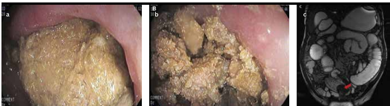
Figure 1. a-c. A bulky bezoar comprising undigested fibers is observed in the gastric body and antrum (a, b); a fragment impacted in the distal jejunum causing small bowel obstruction was detected in MRE after incomplete chemical dissolution and endoscopic removal (c)

nal content in the antrum and proximal duodenum. On upper gastrointestinal endoscopy, a Billroth I partial gastrectomy was observed. A bulky bezoar extending from the distal body to the gastroduodenal anastomosis was identified and successfully broken up in fragments of <2 cm, using foreign body forceps and a polypectomy snare, after through-the-scope irrigation and needle injection with Coca-Cola ® (Figure 1a, b). After the procedure, a solid diet was restarted. The patient became asymptomatic and was discharged the following day. He was advised to ingest large amounts of Coca-Cola ® for a few weeks. After 3 days, he was readmitted because of recurrent vomiting, dehydration, and oral feeding intolerance. On endoscopy, his stomach was empty, but a striking distension of the duodenum and jejunum, filled by liquid and undigested material, prevented mucosal examination. Total parenteral nutrition was started to control malnutrition, and a magnetic resonance enterography performed 1 week later showed a 5.6×3.8-cm bezoar in the distal